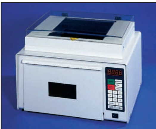
Translinker An ultraviolet blocking cover is included with the transilluminator.