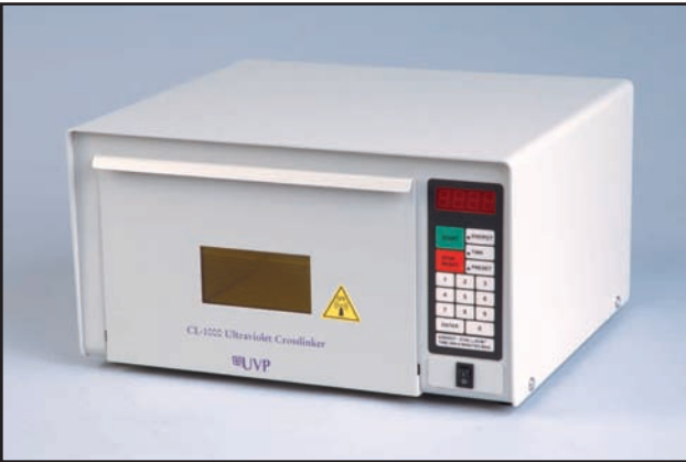
CL-1000 Crosslinker is an exposure instrument which uses shortwave UV energy to bond the DNA to a medium.

UVP Crosslinkers assure consistent UV output for many applications including DNA bonding and UV curing. UV crosslinking for attaching nucleic acids to a membrane for example, takes seconds as compared to oven baking. The crosslinkers utilize a microprocessor to control and measure the dose of UV radiation.